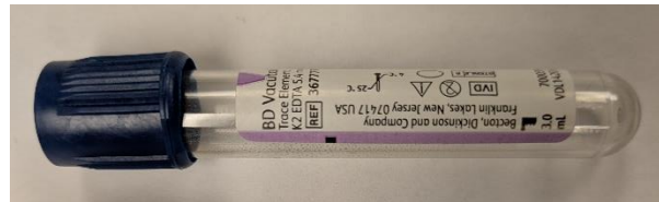
Royal blue-top tube (replacement)*

*Please note the purple stripe on the label is specific for the K2 EDTA tube. Royal blue-topped tube without the purple stripe on the label are not acceptable for this test and samples drawn in these tubes will be rejected.